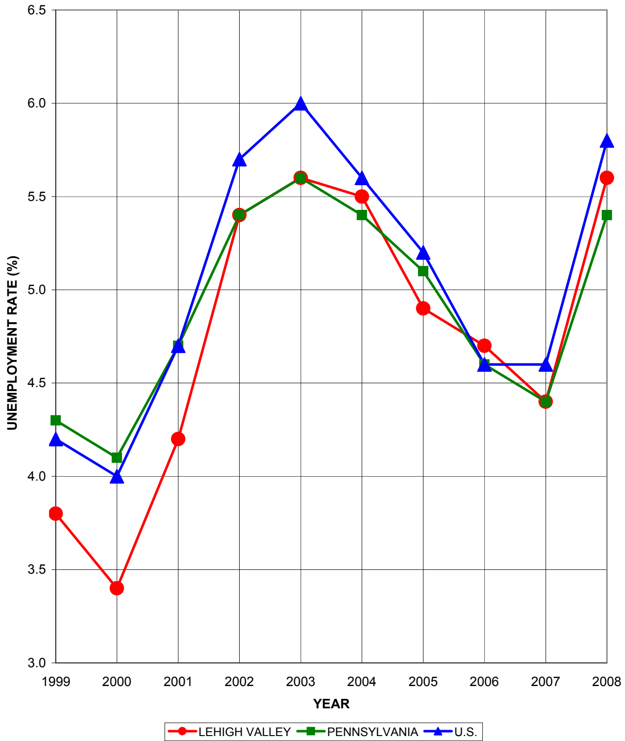
FIGURE 7 UNEMPLOYMENT TRENDS: 1999-2008 LEHIGH VALLEY, PENNSYLVANIA, UNITED STATES