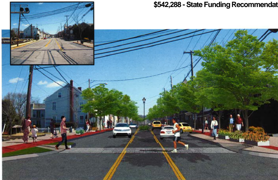
Main Street at Race Street, view south of the railroad tracks